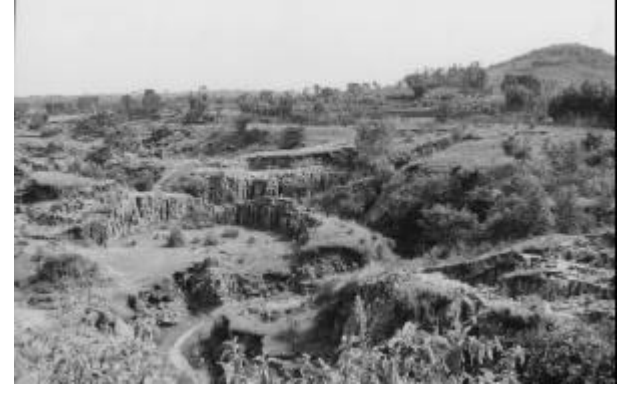
An example of soil erosion in the farmland (Near Sodo, southern part of Ethiopia)

A system that yielded appropriate and stable harvests on a long-term basis with minimal investment has, in recent years, given way to a system with high investments and high returns.